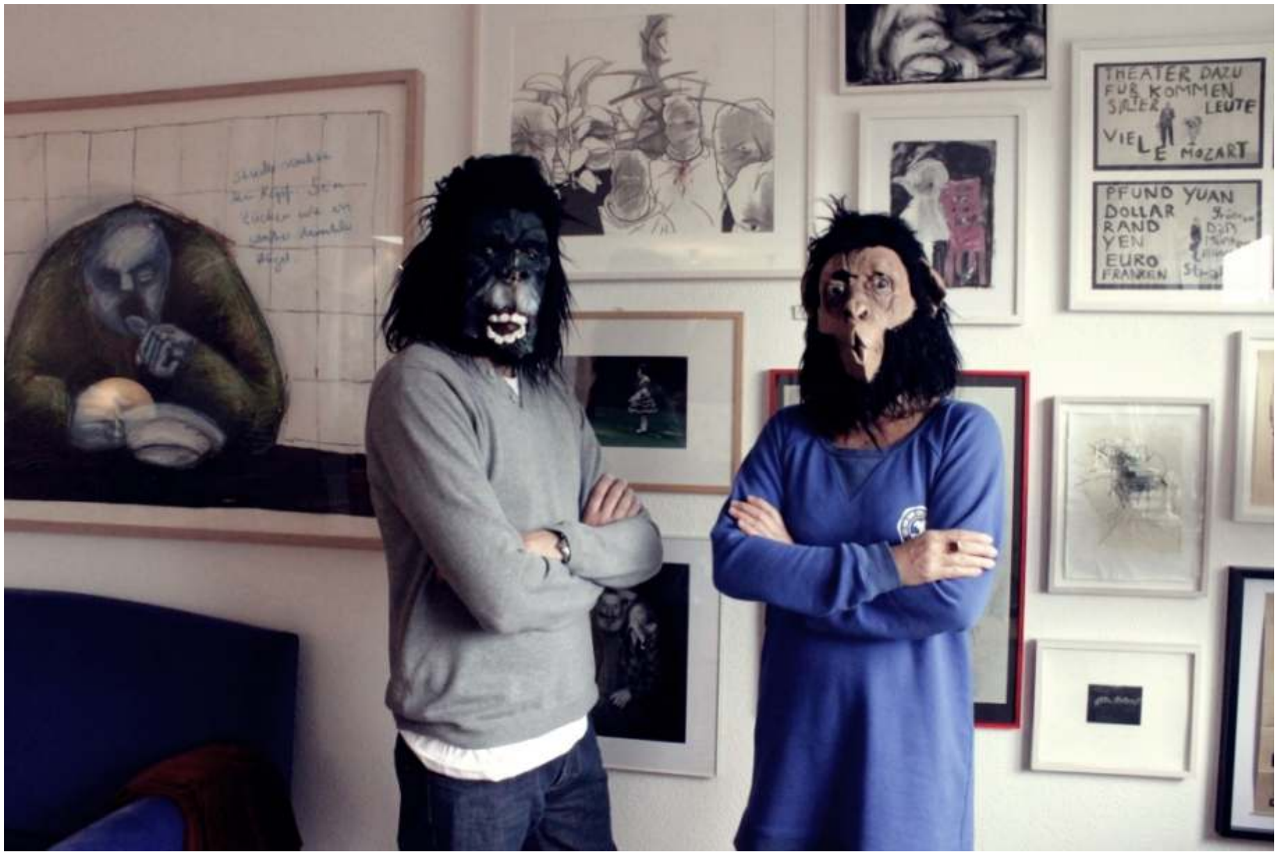
Curators in Lucerne Lambda print, 80x120cm. 2015