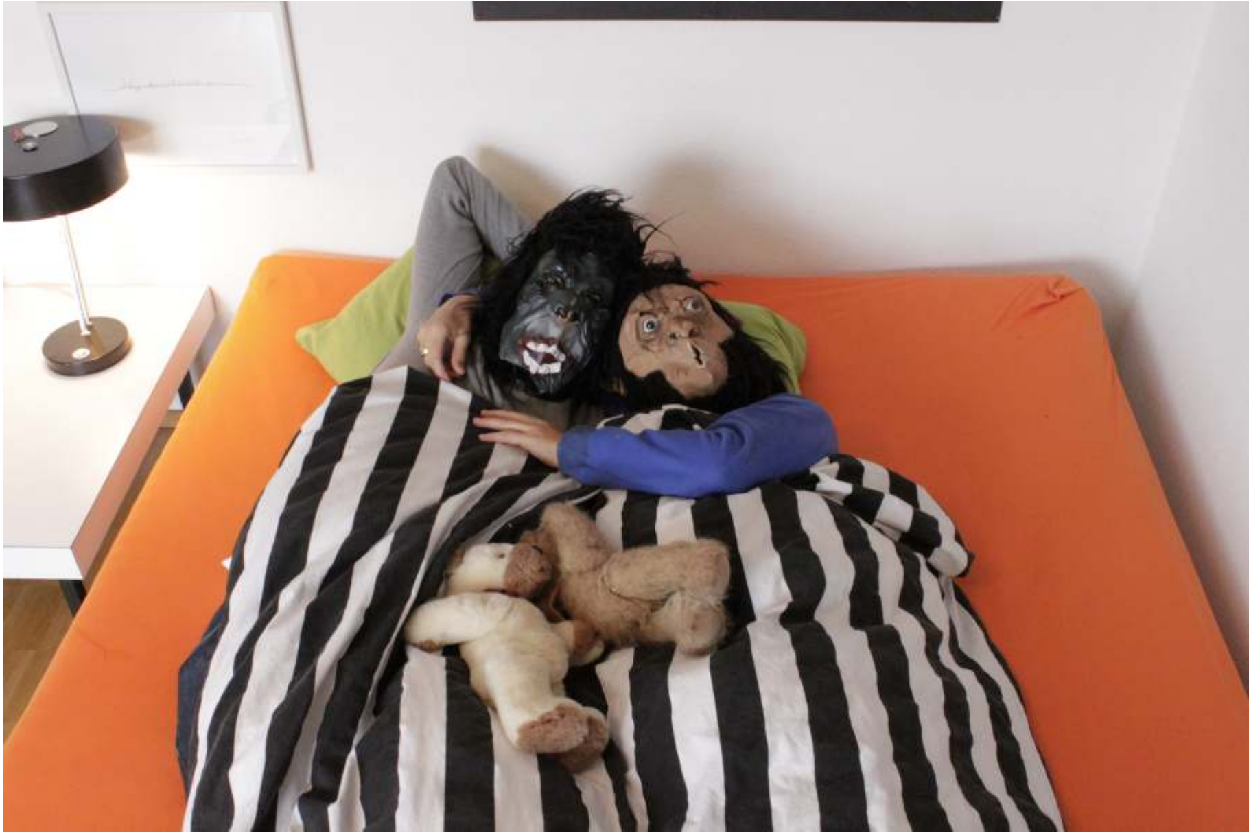
Monkey life 3 Lambda print, 80x120cm. 2015