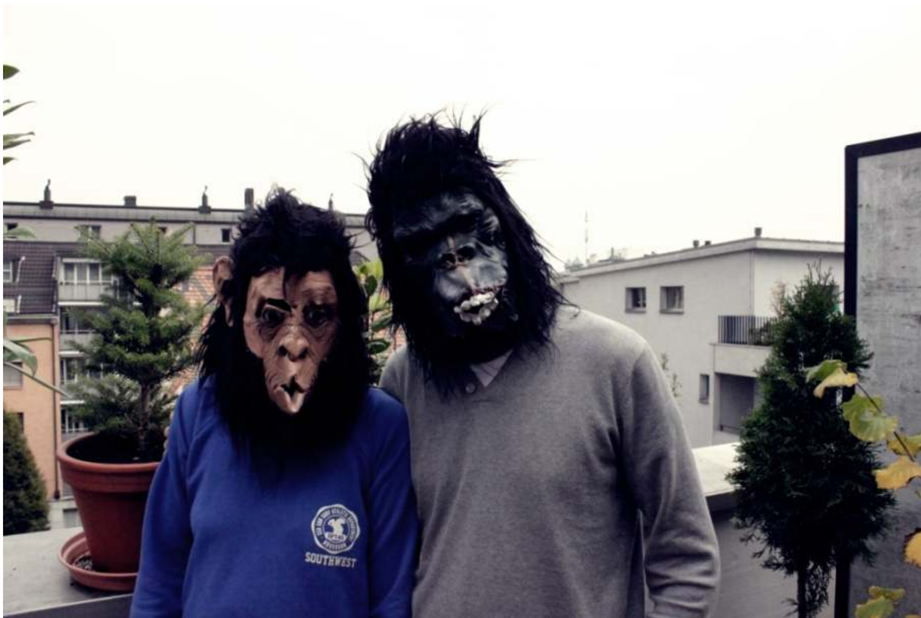
Monkey life 2