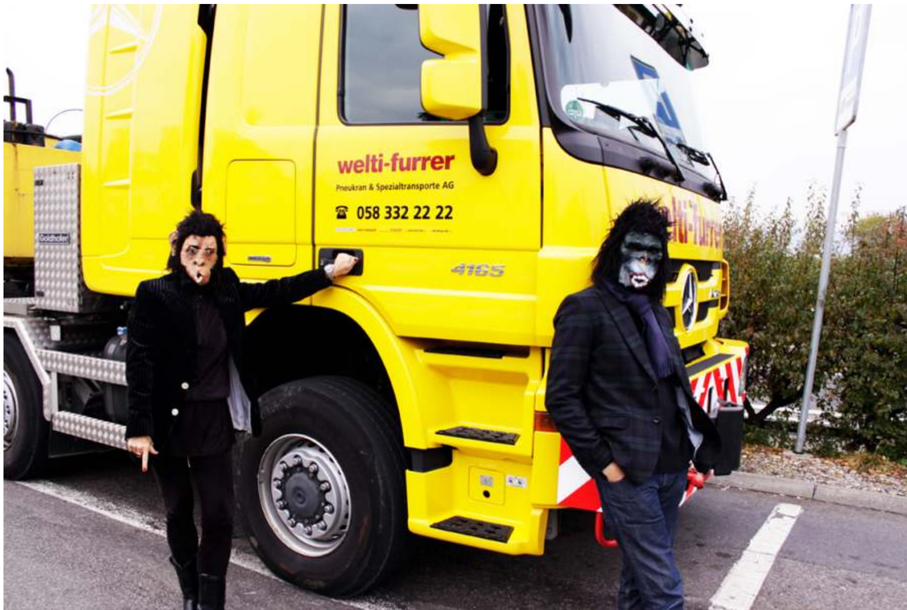
The yellow truck Lambda print, 80x120cm. 2015