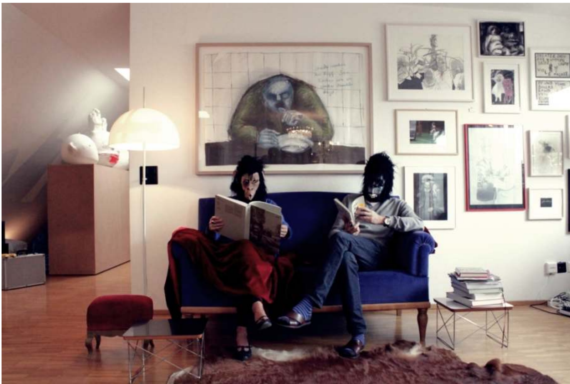
Curators at work Lambda print, 80x120cm. 2015